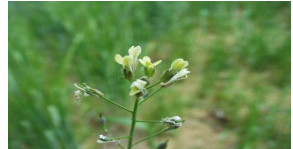
Soy 20/20 (SK)

Development of Camelina Sativa, a new dedicated oilseed crop generating new income opportunities for producers