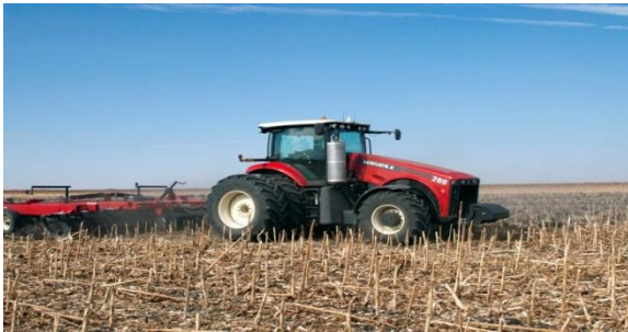
Composite Innovation Centre (MB)

Improve crop fiber quality to increase demand for agricultural fibers for use in transportation and construction manufacturing