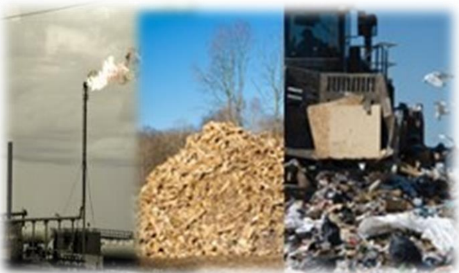
Industrial Off Gas Biomass, MSW Syngas